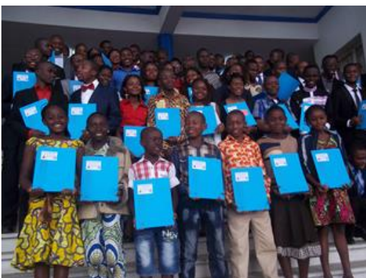
Proud and relieved about their certificates: the new and the prolonged BEBUC scholars from Kinshasa, Kikwit, and Mbanza Ngungu.

For the first time contacts were established with the Congo-American Language Institute (CALI), which cooperates closely with the Fulbright scholarship program. The BEBUC delegates emphasized the crucial importance of the English language within their scholarship program and agreed to collaborate more closely.